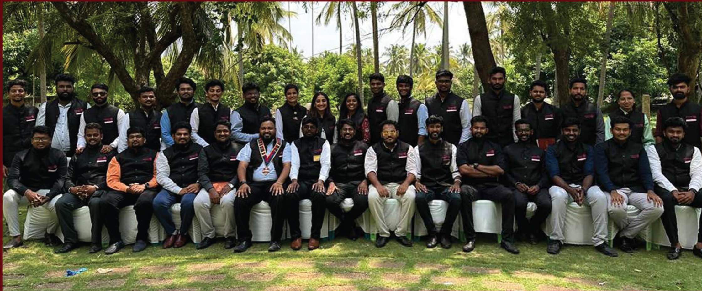
ELEVATE COUNCIL - Our DRR with District Council Members during DOTS 2023 held at Kollengode, Kerala hosted by Rotaract Club of Western Valley (28 May 2023, Kollengode)