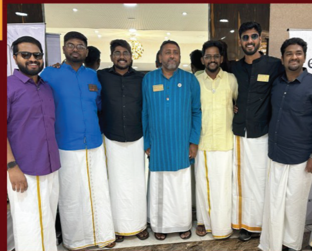
Our DRR with fellow delegates from RI District 3201 during Rotary Zone Institute organised by RSAMDIO (April 30, 2023 Mumbai)