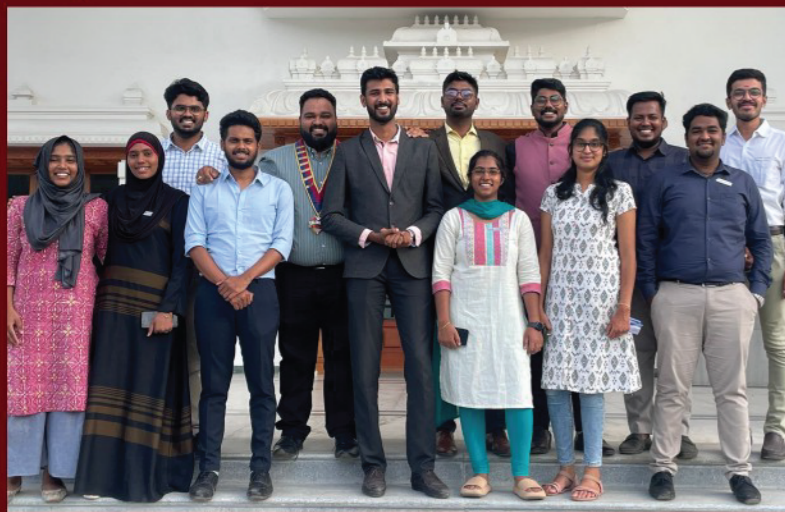
TRAINERS CONCLAVE - A Trainers Conclave was conducted on 11 June, 2023 at Kumaraguru College of Technology and was hosted by Rotaract Club of KCT.