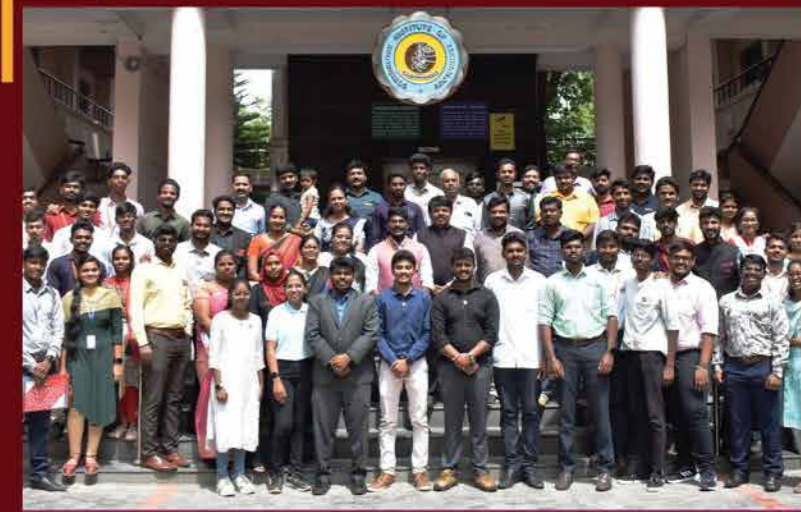
A Meeting of Faculty Coordinators of Rotaract Clubs based in Coimbatore Region was held on 24 June, 2023 at Coimbatore Institute of Technology and hosted by Rotaract Club of CIT