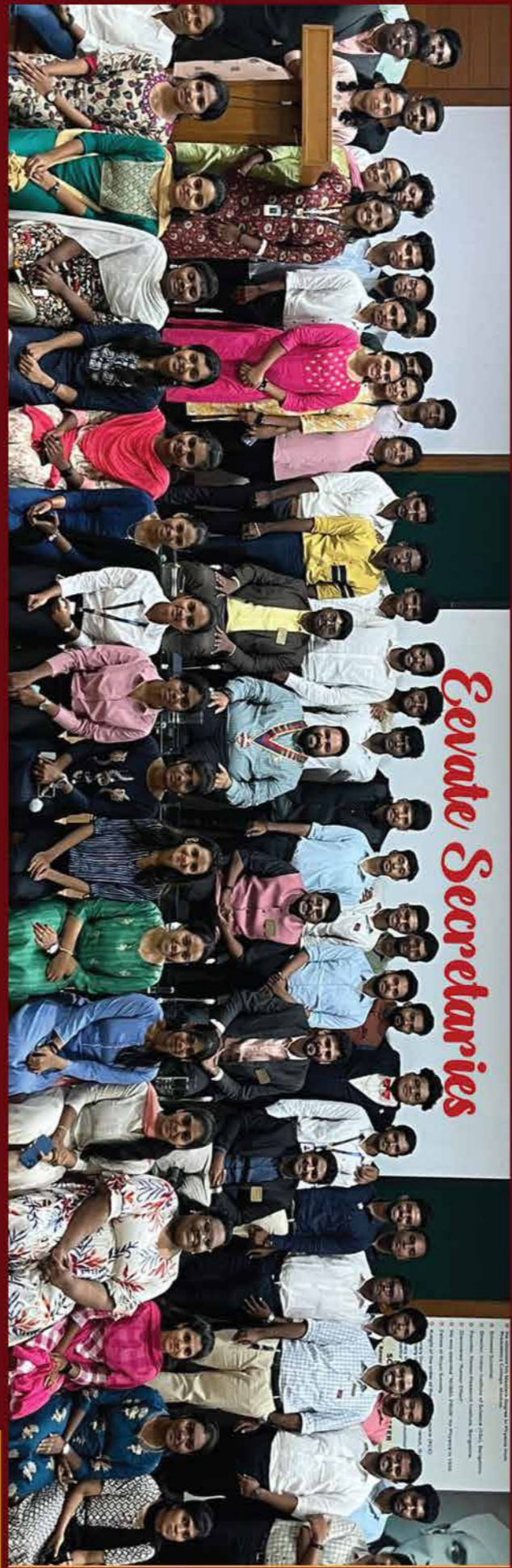
Our DRR with Secretaries of Coimbatore Region during Pre Presidents Meeting hosted by Rotaract Club of KCT (June 11, 2023 Coimbatore)