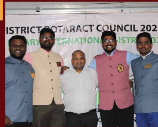
Our DRR and DRR Elect attended the PETS of RI District 3203 and were a part of a panel discussion on Rotary (June 25, 2023 Ooty)